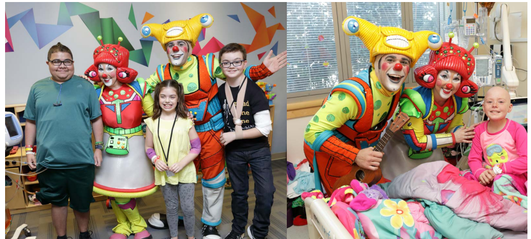
A surprise visit from Ringling Bros. and Barnum & Bailey Circus clowns restores the wonder of childhood to three long-term pediatric patients at the NIH Clinical Center March 29. The visit was a precursor to the 20th annual Children's Premiere Night put on by the circus the next evening in Washington DC.

Read more online! Scan the barcode or visit www.cc.nih.gov/about/news/newsletter.html