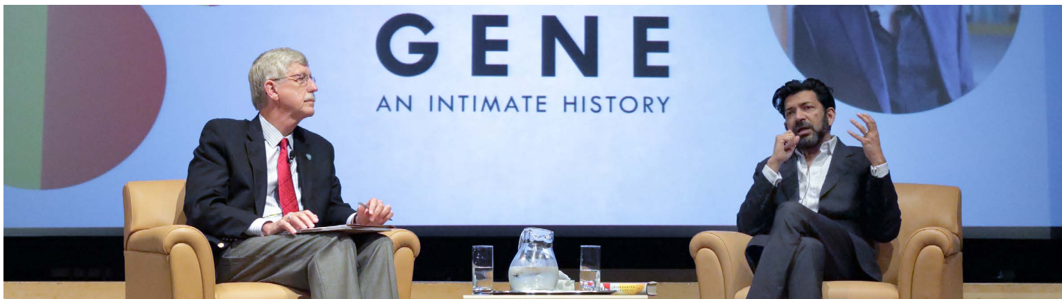
Dr. Siddhartha Mukherjee (right), Pulitzer Prize-winning author of “Emperor of All Maladies”, visits the National Institutes of Health April 17 to give a presentation based on his new book “The Gene: An Intimate History.” He led the audience through a history of genetic medicine, including the early findings and assumptions of genetics’ founding fathers, how eugenics emerged as an area of study and its devastating costs to society and how genetic information is used in present day practice. Following his lecture, Dr. Francis Collins, director of the NIH, and Mukherjee discussed the important issues and ethical questions around the use of germline manipulation technologies such as gene editing and what the opportunities and consequences of such technology can be for the human race.